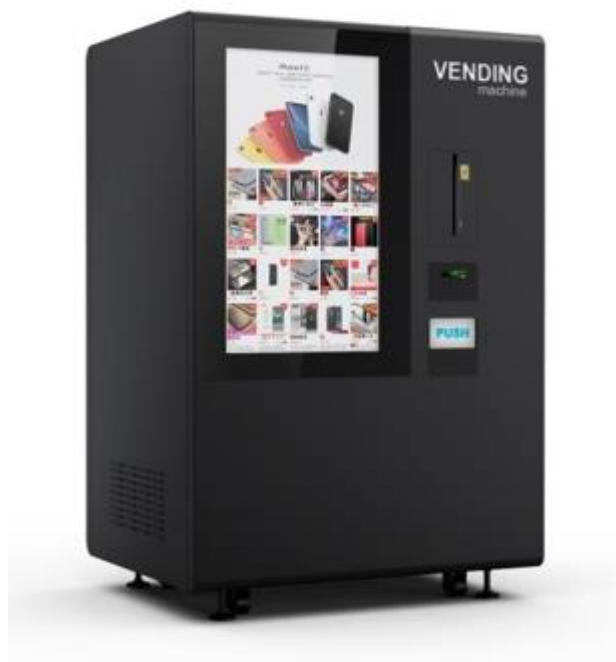
Exhibit 7: Customskins vending machine

Exhibit 5 above demonstrates the importance of the mobile phone market for NVU longer-term given the number of units in circulation.