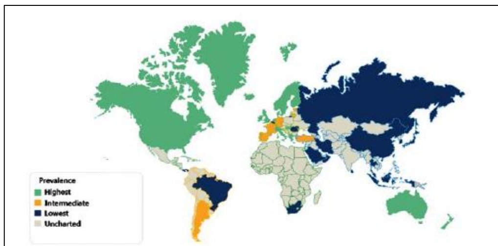
Figure 3: Prevalence of IBD